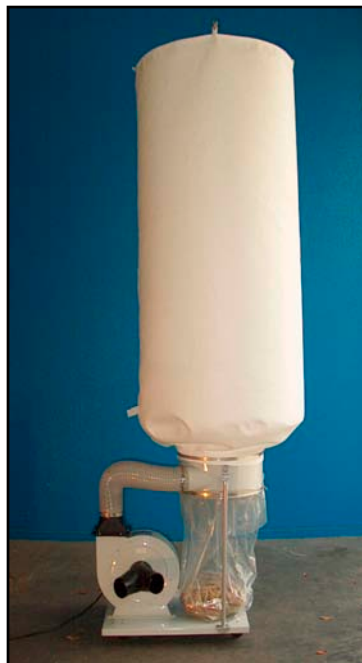
Optimized 1-micron dust bags for any collector