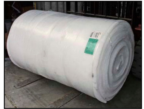
Exhaust filter media, paint booth filters