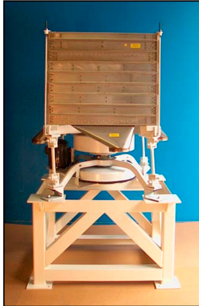
2, 3, & 4 separation gyratory sifter