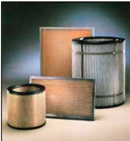
OEM replacement cartridge filters