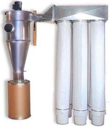
Plenum style bags or sleeves