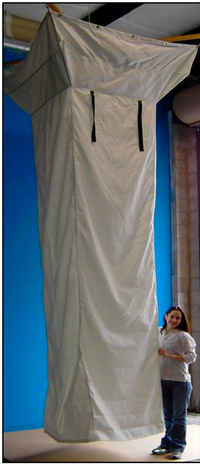
Custom Dump Chutes