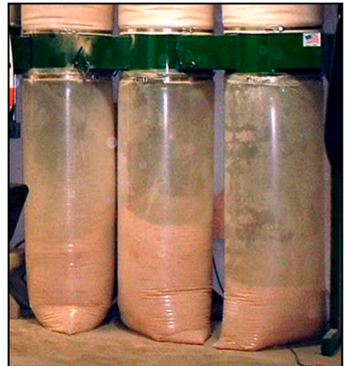
6 mil disposal collection bags for most collectors

FABRIC SUGGESTIONS • TECHNICAL ASSISTANCE • CUSTOM DESIGNS