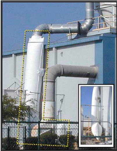
Custom solutions to bag house change outs

Dust Bags, Cartridges, Transfer Sleeves, & Liquid Filtration