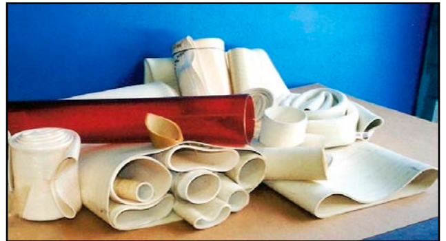
Connecting sleeves, smooth wall rubber tubing, polyurethane tubing, corrugated tubing