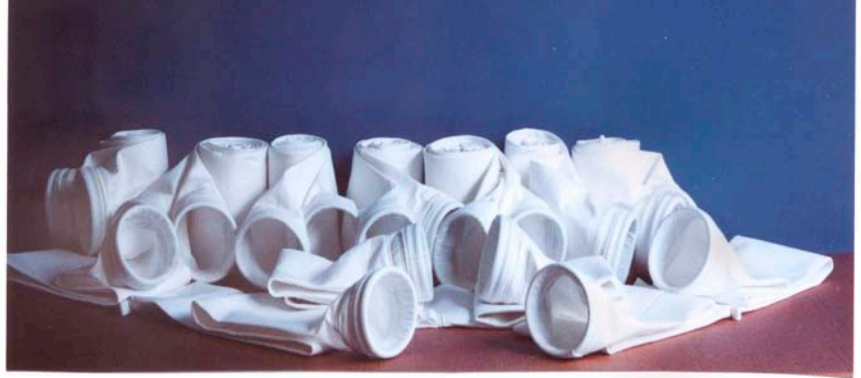
OEM replacement dust bags for most dust collectors; flame retardant treatment available