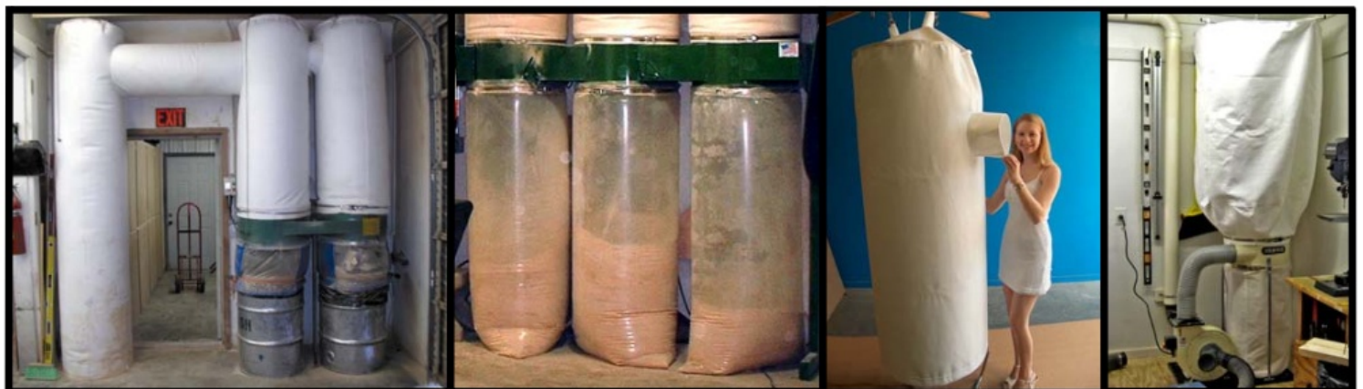
Custom Designed "Sister" Bags